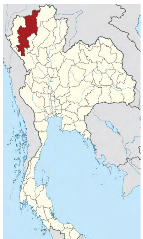
Map of Thailand

as crafts, folk arts, architectural styles; and (2) intangible cultural heritage, such as historical contexts, traditional beliefs, cultural events, artisanal skills, and craft production by "Sala," which means "local artist" in Northern Thai language called Lanna Language or Kham Mueang (Kuntaja 2014, 91). Both kinds of cultural heritages are the proof of prosperity and social development of the city that have been handed down to the new generations. Moreover, Chiang Mai always welcomes a constant flow of tourists from all over the globe since the city is one of the most famous tourist destinations in Thailand with high potential due to several tourism activities and convenient facilities