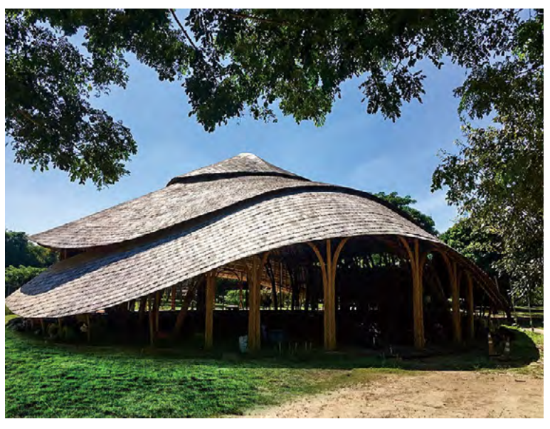
Lanna architectural style is integrated with contemporary style