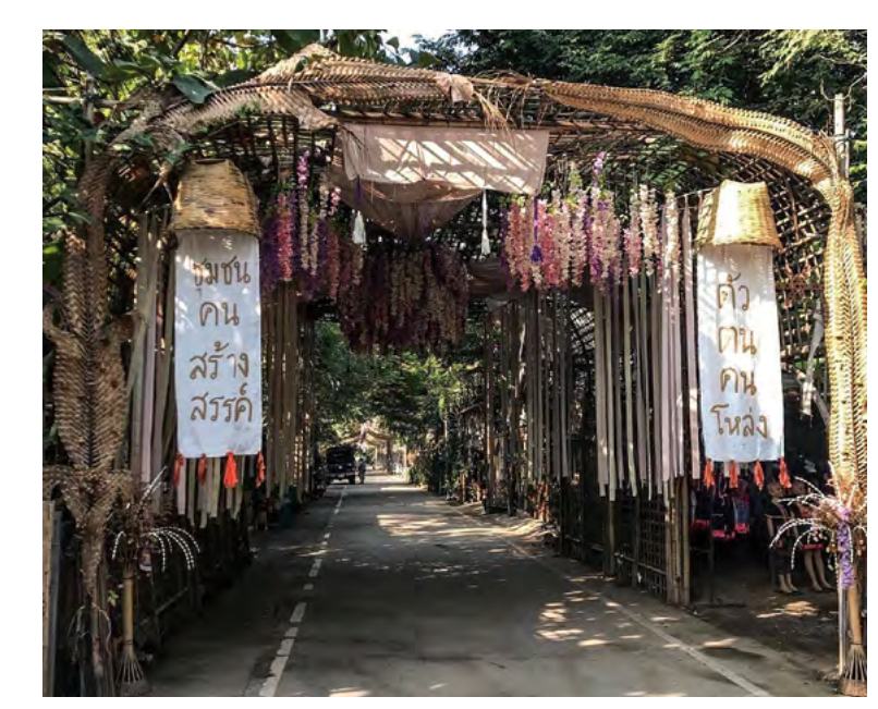
Local crafts community in Sankampang District, "Loang Him Kao"

Chiang Mai has several sites of traditional craft production, and its outstanding crafts can be divided into nine categories: (1) sculpture, (2) textile, (3) wood carving, (4) traditional construction, (5) painting, (6) basketry, (7) paper, (8) metal, and (9) lacquerware. Chiang Mai has been heralded as the city of cultural diversity, where local wisdom and traditional cultures are continually conserved and supported to seek maximum benefits for the locals, which significantly influences its economic matters and social security. Cultural industry has been promoted and empowered as one of the important sources of revenue for the city. An encouragement in regard to cultural capital, together with product development, has generated more job opportunities and led to income distribution through cultural industry and tourism industry as well.