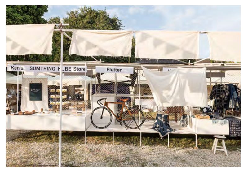
Creative product design exhibited in Chiang Mai Design Week

During 1981-2001, Thailand welcomed a large number of foreign investors who focused on investing in developing countries with minimum wage, particularly in Southeast Asia or Latin America. The industrial investment was significantly settled in many designated areas all over the country, and they are collectively called the "industrial estate."