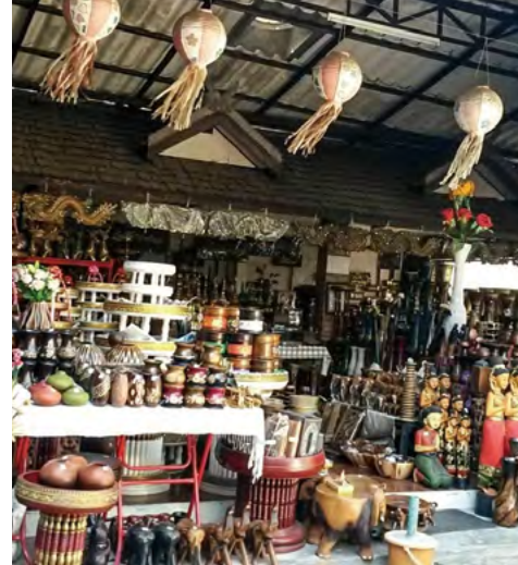
Souvenir shop in Baan Tawai Village