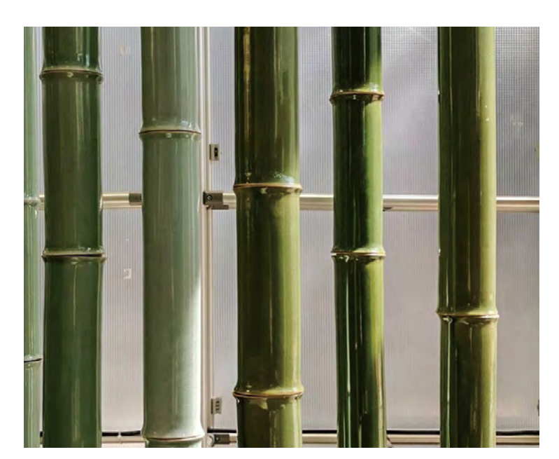
Bamboo Wall exhibited in Chiangmai Design Week 2019

Nowadays, the factory has its own capacity production up to 400,000 pieces per year. The factory has recently collaborated with Plural Designs Co., Ltd. launching a new product design for the special exhibition held during the annual event of "Chiang Mai Design Week 2019." Two interesting celadon items were exhibited: (1) Bamboo Wall, the bamboo imitation wall with