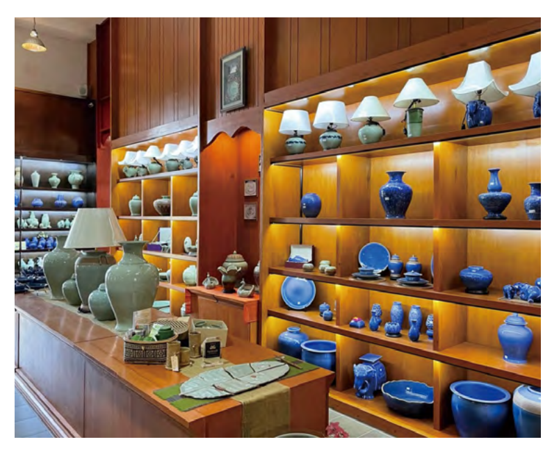
Siam Celadon Factory

The typical item is the round plate or vase with floral in a pleasing twisting pattern design. The skill of the artist is prominently displayed with cuts of varying depths and sizes to bring out a three-dimensional effect. This is a former character of celadon since it used to be an exclusive household ware of the Chinese emperors, while general people were not allowed to use. These days, anyone can own a piece of celadon, and they can buy items like full dining sets and literally hundreds of other creations. But one must be aware that there are also a lot of poor imitation products.