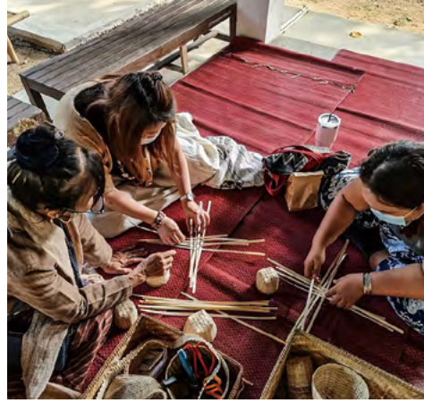
Craft workshop in Chiang Mai Crafts Fair

goods, these marketplaces have also played an important role in politics, economy, society, and culture. In fact, the existence of local markets and the exchange of goods have been very important component of the concentration of political power (Ruangsri 2021, 5).