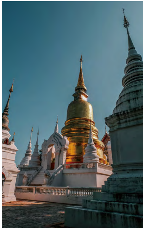
Pagoda in Suan Dok Temple