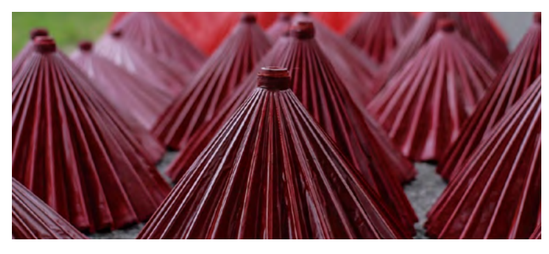
Paper umbrella Source: https://www.creativecitychiangmai.com

Source: https://www.creativecitychiangmai.com