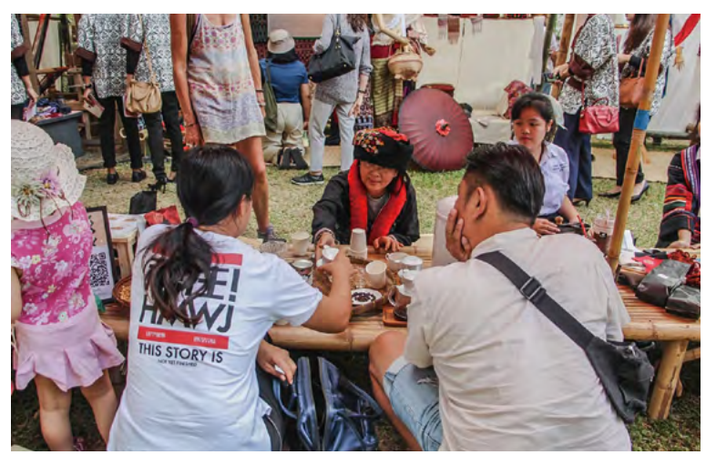
Cultural dissemination activity in Chiang Mai Crafts Fair

Lanna people, collectively referred to people who live in northern part of Thailand, originally created crafts as their daily utensils. Later, people tended to create a large number of crafts for commercial purpose since there were a lot of orders from surrounding communities. Local crafts were also used as a tribute for exchange with other communities. The craft selling sites of Lanna people were not only a place for exchanging goods, but also a place where people, regardless of their gender, age, and social status, could freely share their information, knowledge, and skills, especially among those people who had similar culture (Ruangsri 2021, 4). In the past, people usually traveled to other communities with several purposes, and one of them was for business. Many local markets, or what can also be called goods exchange centers, were allocated all over the city to facilitate these activities. Small local markets in each community were linked with the large one located at the city center through merchant middlemen. In addition, by gathering and distributing