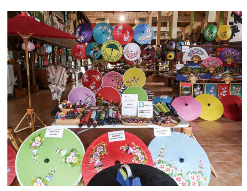
Paper umbrella

International Journal of Crafts and Folk Arts / Vol. 2 (2021)