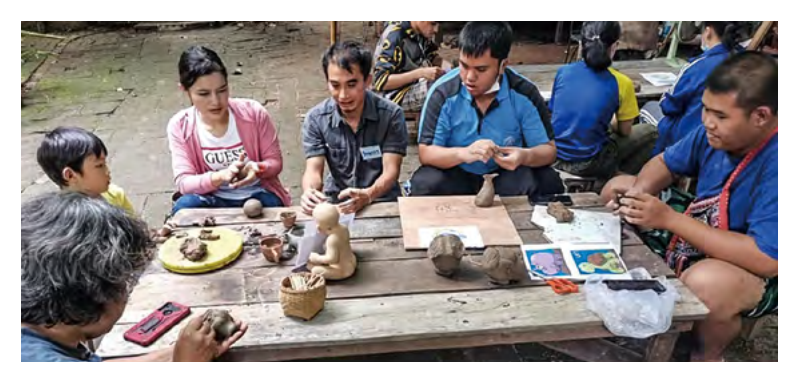
Pottery workshop at Pottery Learning Center, Mae Wang District