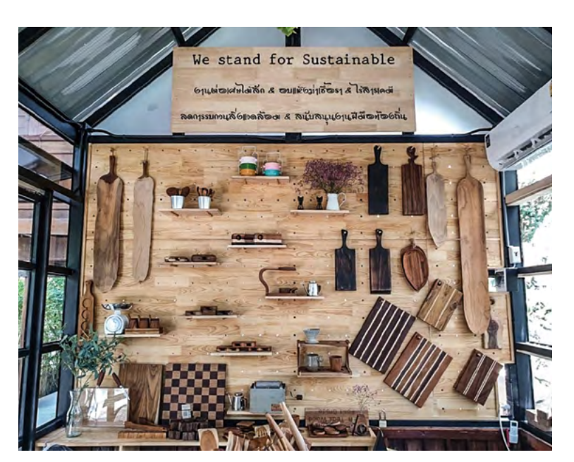
Creative crafts in Chiang Mai

The inventory made by Microsoft.com in 2019 found that 86 percent of consumers used their online platforms searching for local business and almost half of these Google searches from all over the world were related to local information and database. This statistic might indicate that the global trends seem to be more interested in local contexts. People in contemporary