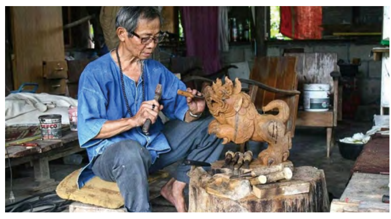
Wood carving in Baan Tawai Village

need of customers who are mostly Thai and Chinese middle class. The products include Singha (mythological animal), tiger, elephant, musician doll, lotus for Buddhist altar decoration, wooden frame with bunch of vines, etc.