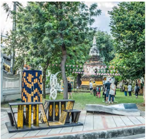
Art installation in old town area