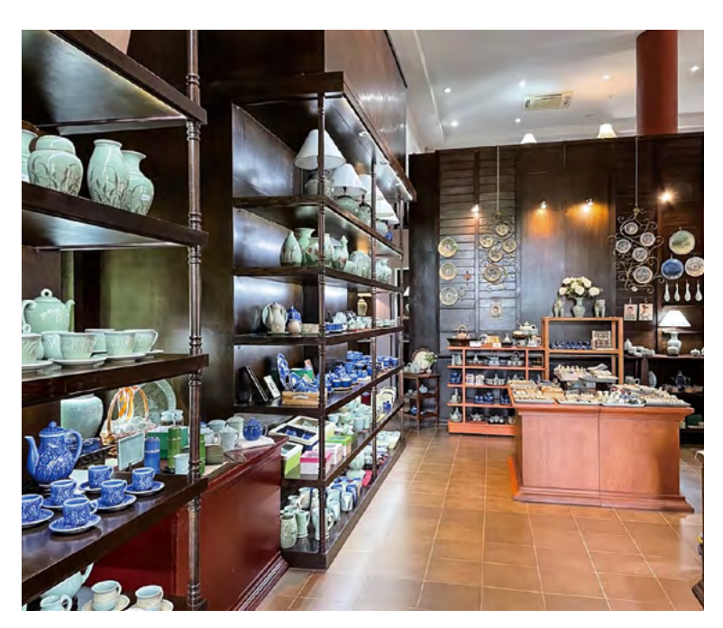
Siam Celadon Factory

The "paddy field black clay" is used because of its special qualities. It is cleaned in water and then filter-pressed to drain the water out. After going through pumps and grinder the mixture is ready for shaping, being now a soft lumpy slab. To form this clay into a desired shape and purpose, three choices are implemented: (1) moulding into a plaster cast to make a