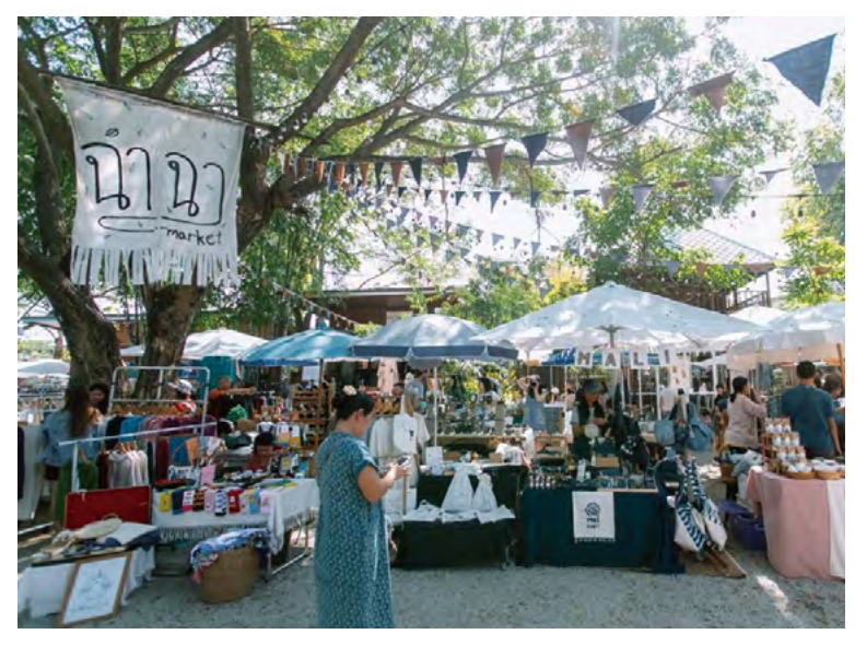
Local crafts market in Sankampang District, "Cham Cha Market"