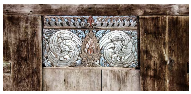
Hum Yon

Traditional way of life has inevitably been impacted by contemporary culture because of globalization and modernization. Local people are more or less getting used to the new culture which always interrupts their daily life in several ways, such as in consumer goods, social trends, foods, social media platforms, etc. These influences can also reflect on the cultural goods made available for customers who are interested in new style of works.