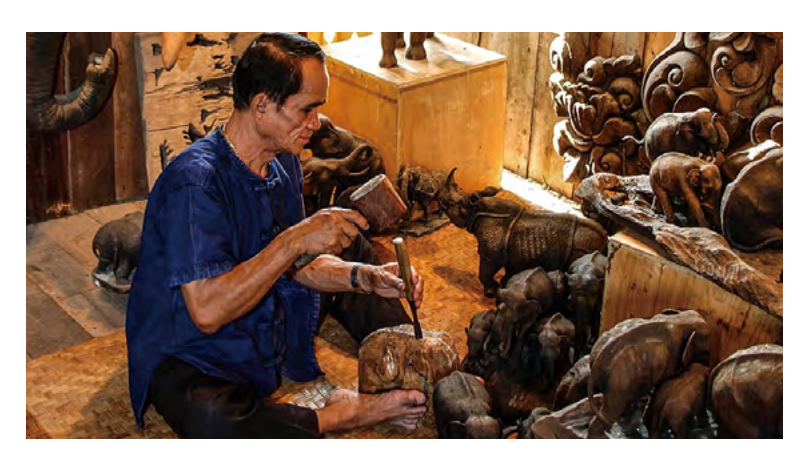
Wood carving in Baan Tawai Village

Despite the different styles of wood carving found in Baan Tawai Village, every style has been producing to cater to an individual customer, which is similar to the situation of wood carving communities found in Sukhothai Province, Thailand and so as in other countries (Wattanaphan et al. 2001, 47–50).