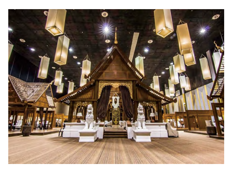
Lanna architectural imitation in Chiang Mai International Exhibition and Convention Centre