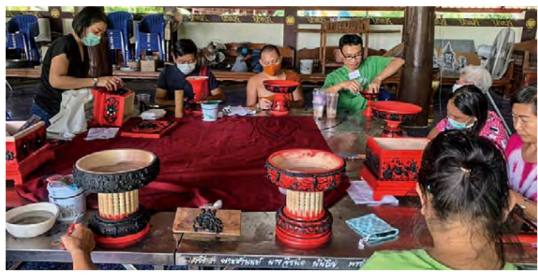
Rak Samuk sculpting workshop in Baan Tawai Village

Local crafts have been formerly created as daily equipment or household utensils, such as tools, clothes, accessories, religious oblations, and tributes, which are generally made from raw materials found in each community and the surrounding areas. In the past, one community needed to interact with others for many reasons. The communication between communities led to commercial activities, cultural exchange, and economic security. Local crafts