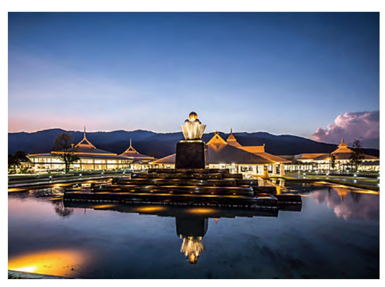
Lanna architectural style is integrated with contemporary style