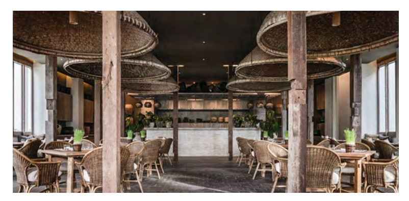
Traditional craft items are used in contemporary interior design