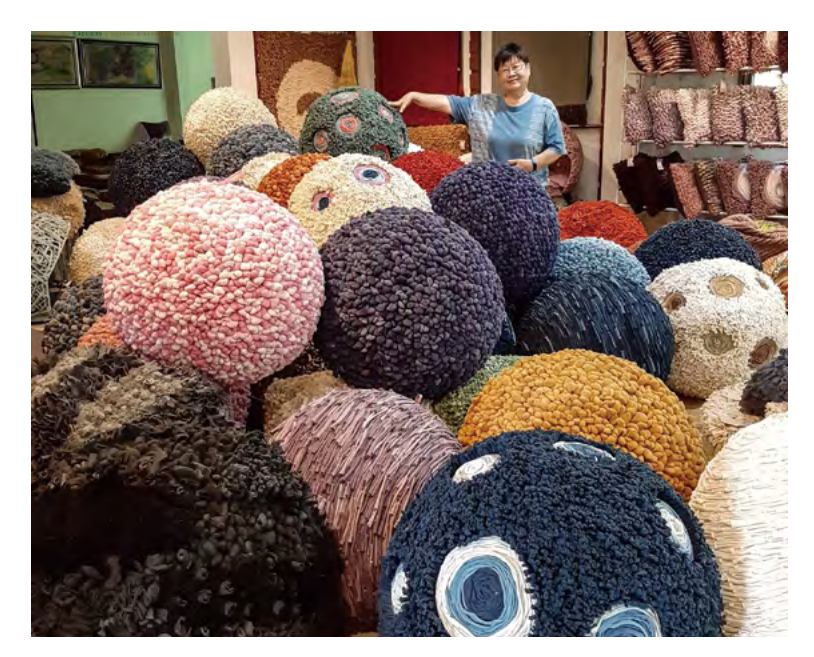
Bua Bhat Art of Green Home Products

society mostly focus on diversity and specific identity of each community, so that special story or storytelling related to a local product is implemented as one of value-added marketing strategy to generate more interests. The survey on consumer behavior in the city center of Chiang Mai towards local craft products in daily life found that 54.5 percent of the respondents appreciated their local craft products more, after the stories were well transmitted to them. The result of this survey also found that 72 percent of Chiang Mai citizens were more confident to use local craft products than industrial products. One of the main reasons was that the professional skills of local artisans are more reliable. Their contributions, particularly from artisan or entrepreneur who has a long experience in this field, have also been elaborately made. Some of the products have been creatively redesigned by integrating local identity and contemporary concept and the products are then perfectly composed of aesthetic and some new functions to cater to