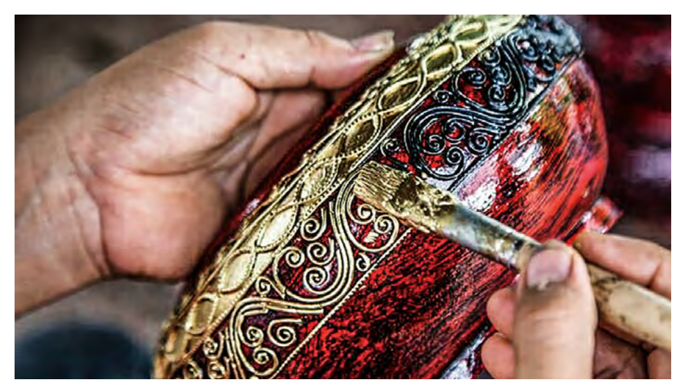
Rak Samuk sculpting (Rak Samuk is a material made from the mixture of Samuk, black lacquer, wood, oil and lime neutralized by turmeric)