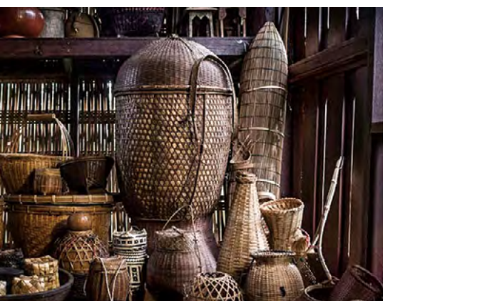
Traditional bamboo weaving used in daily life