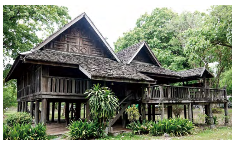
Traditional Lanna House

Each society has its own cultural practices and tradition, as well as social value, belief, religion, art, etc. These things can be changed due to external influences since people always exchange their cultural identities and products with others. Some cultural products are made from different cultural identities. Others are used in new contexts. For example, "Kalare" and "Hum Yon" are now used for decorating walls in house, hotel, or northern Thai food restaurant, although they were traditionally placed above the entrance in front of the house roof to prevent bad things. As such, while the purpose of utilization may change with time, the products still remain as the identity of Lanna traditional culture.