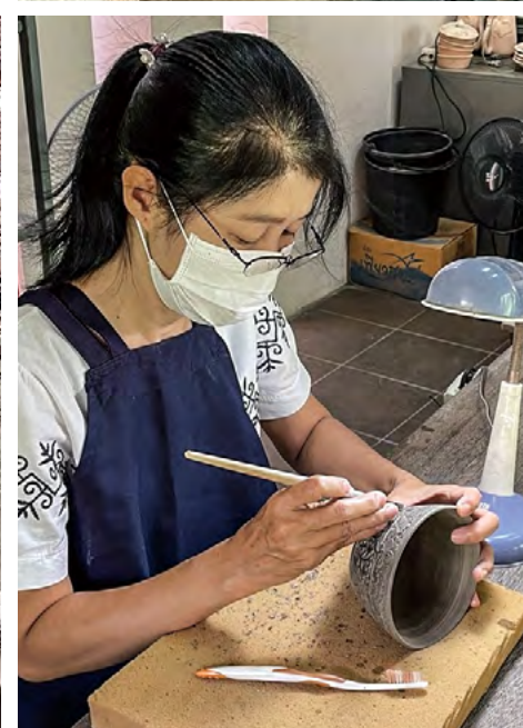
Siam Celadon Factory

It is not possible to get all the pieces in the same shade, since wood ash is an important component in the glaze melting process. The ash is from different kinds of trees. Even though the trees are from the same species, they may be of different ages and locality. This can cause a distinctive colorization and exceptional character of celadon. Moreover, despite the availability of the modern technology, there is no foolproof certainty. The factory needs to make sure that all the processes are kept spotlessly clean and dust particles is not mixed up in the processes. That is why a masterpiece of work is expensive and there are only a small number of high-quality factories in Chiang Mai.