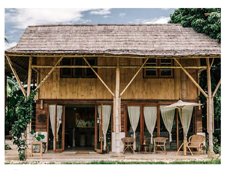
Coffee shop with traditional materials and design