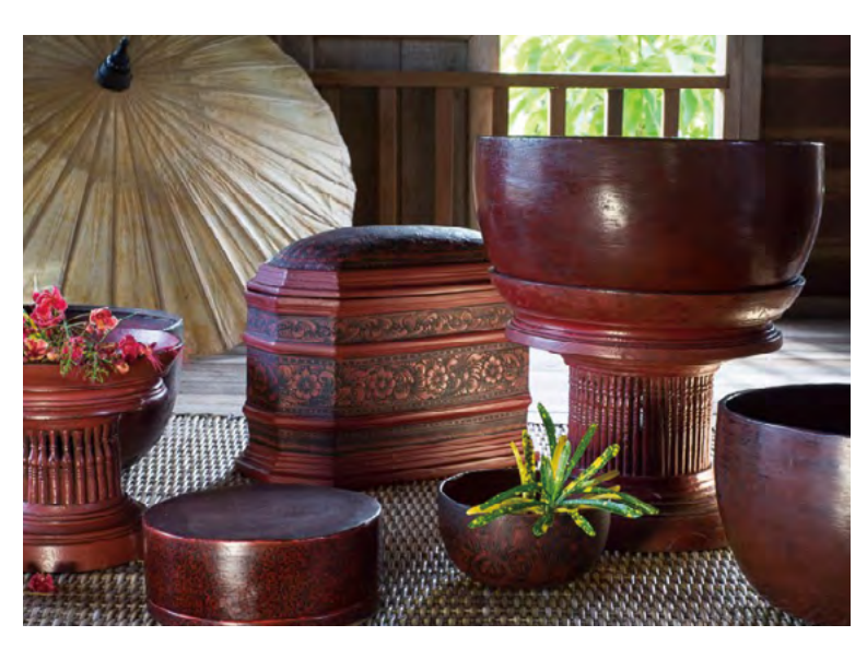
Traditional lacquerware from Tai Kuen people (one of ethnic groups in Chiang Mai)

Source: https://www.creativecitychiangmai.com