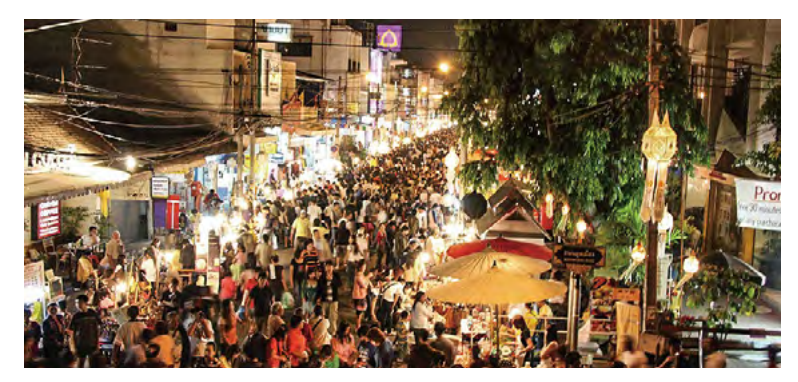
Walking street in Chiang Mai

as crafts, folk arts, architectural styles; and (2) intangible cultural heritage, such as historical contexts, traditional beliefs, cultural events, artisanal skills, and craft production by "Sala," which means "local artist" in Northern Thai language called Lanna Language or Kham Mueang (Kuntaja 2014, 91). Both kinds of cultural heritages are the proof of prosperity and social development of the city that have been handed down to the new generations. Moreover, Chiang Mai always welcomes a constant flow of tourists from all over the globe since the city is one of the most famous tourist destinations in Thailand with high potential due to several tourism activities and convenient facilities